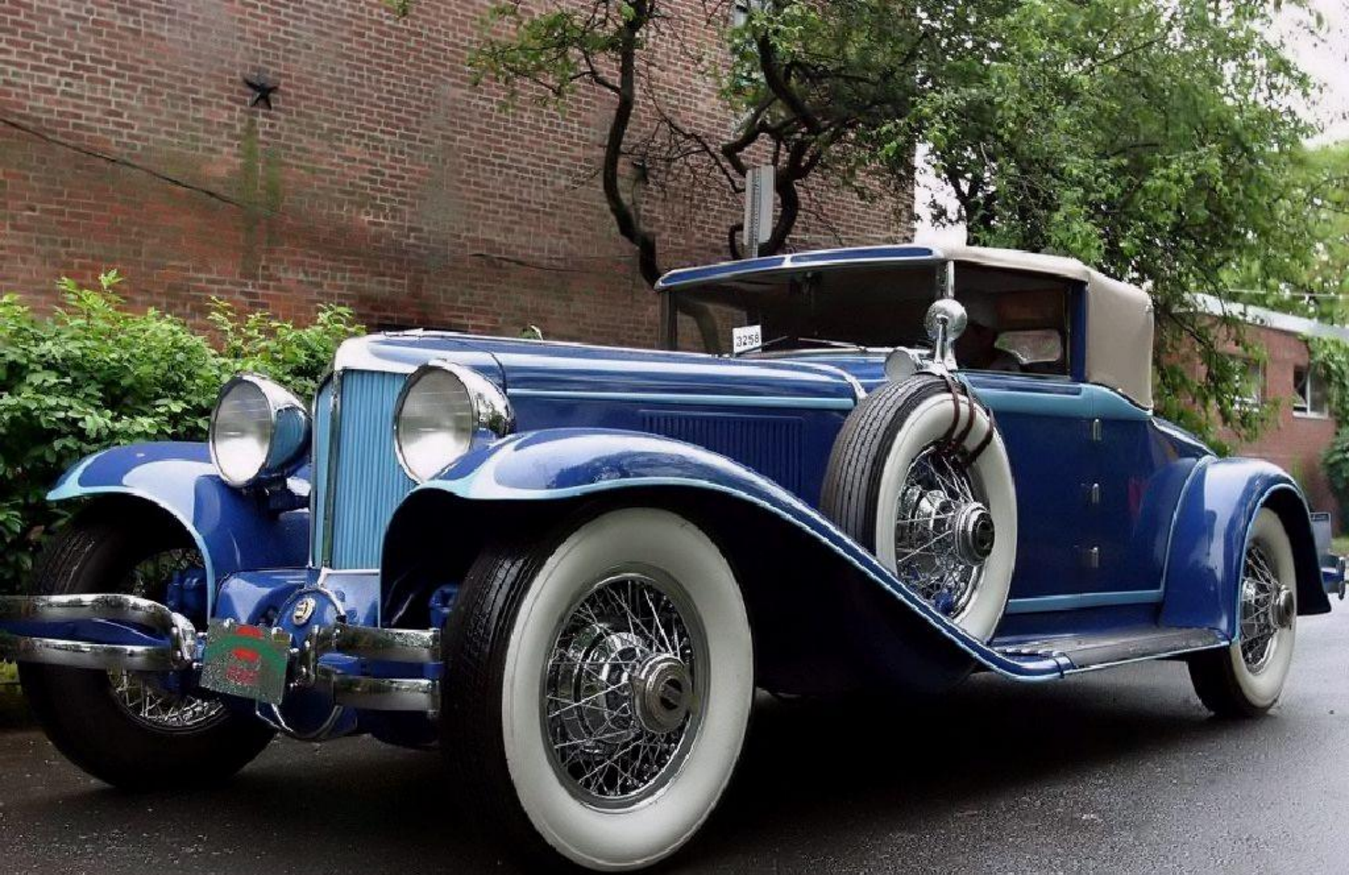
1930 Cord L29 Rumble Seat Cabriolet