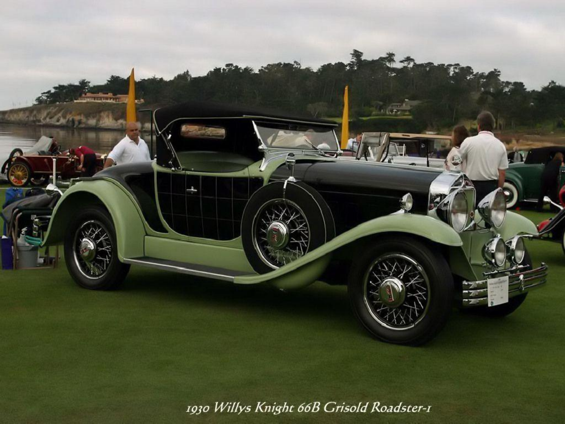
1930 Willys Knight 66B Grisold Roadster-1