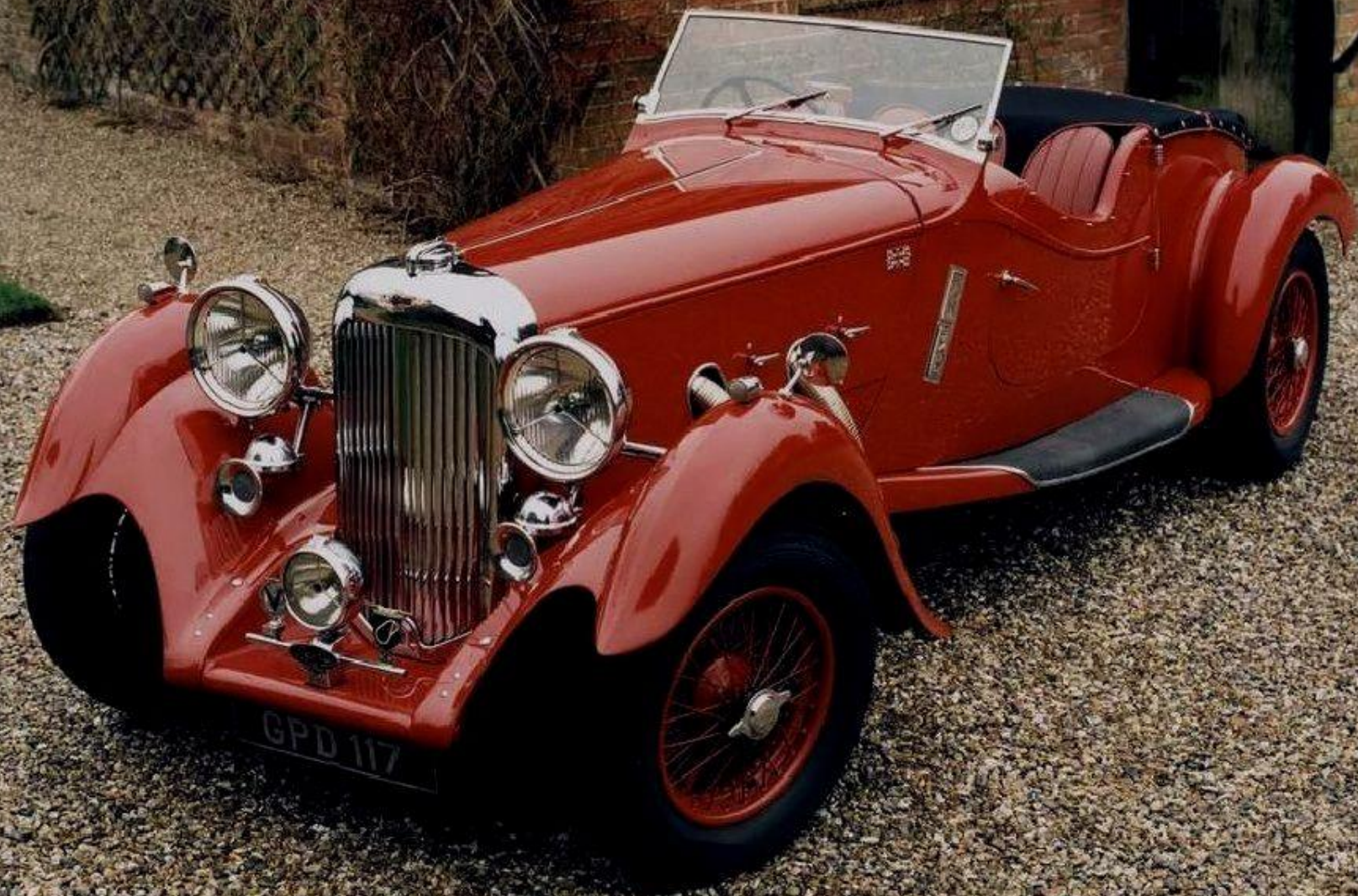
1939 Aston Martin Lagonda V12 Rapide