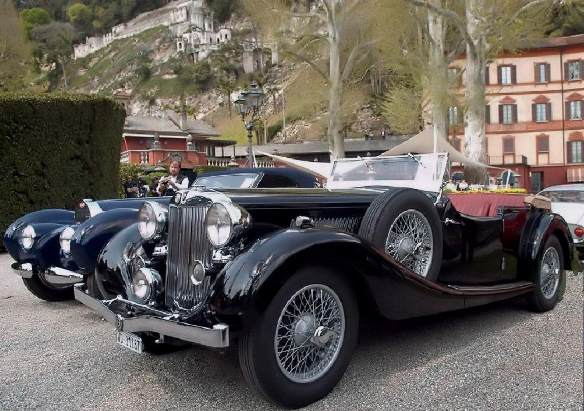
1939 MG WA Open 4-Seater Tourer