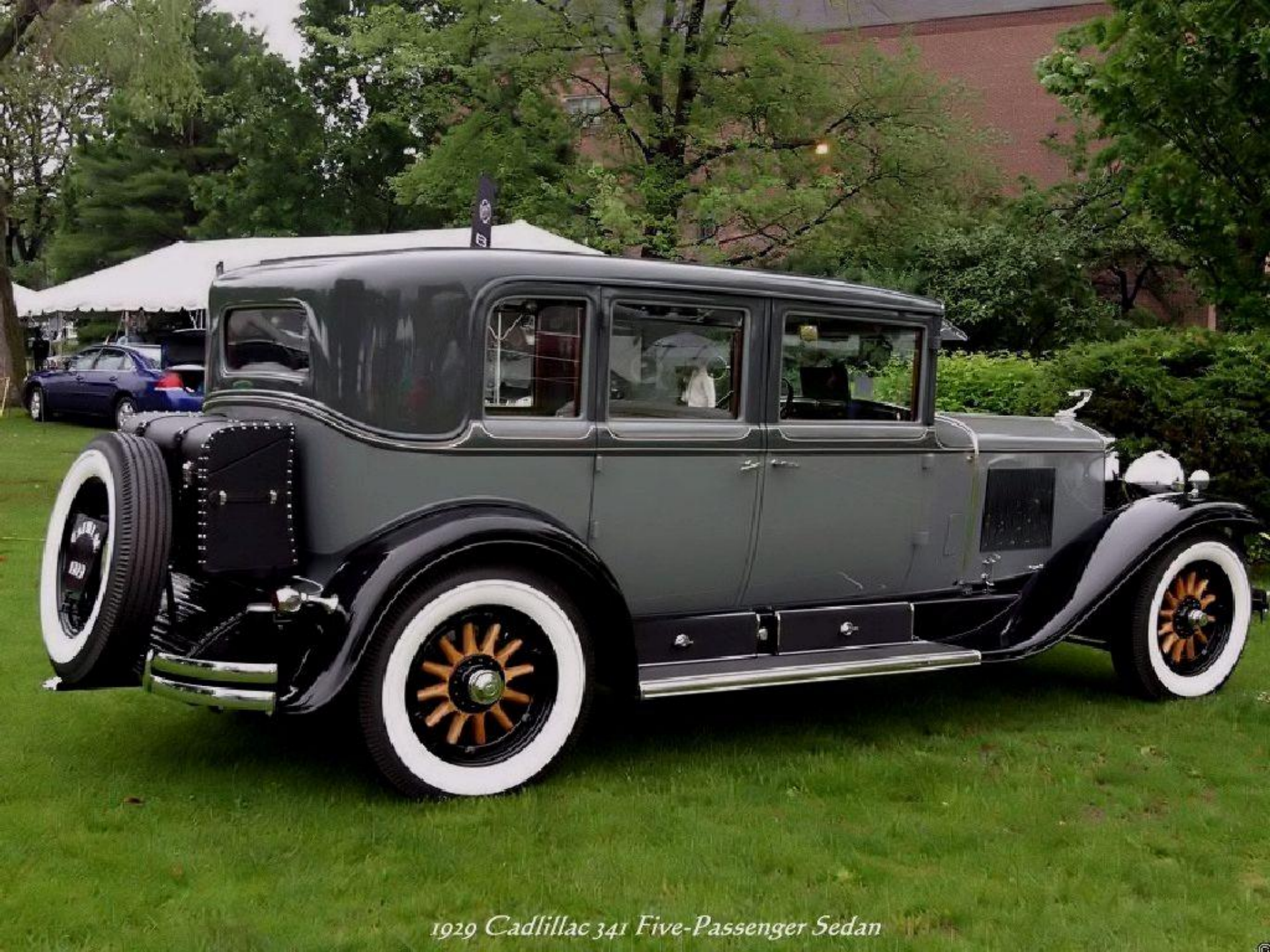
1929 Cadillac 341 Five-Passenger Sedan