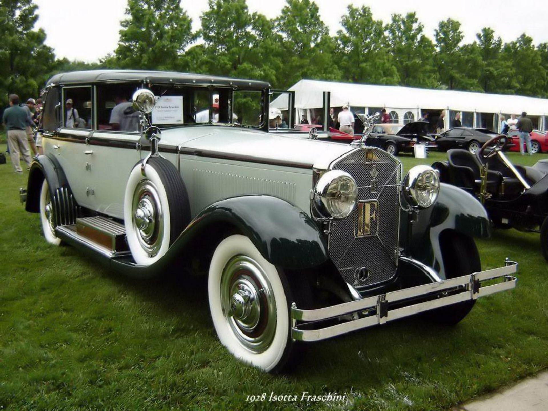
1928 Isotta Fraschini