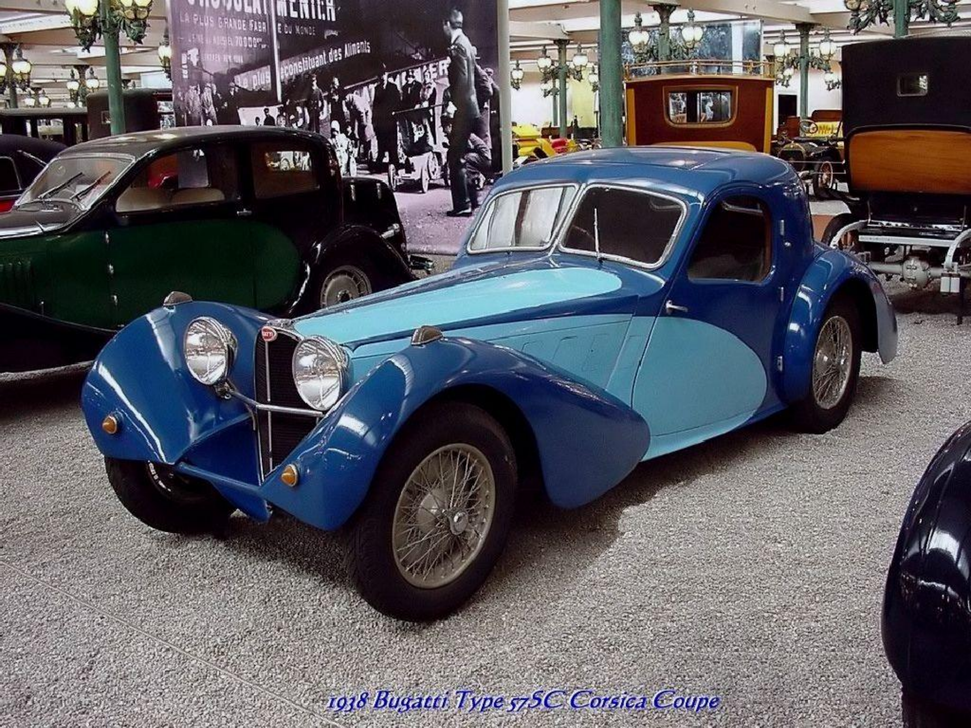
1938 Bugatti Type 57SC Corsica Coupe