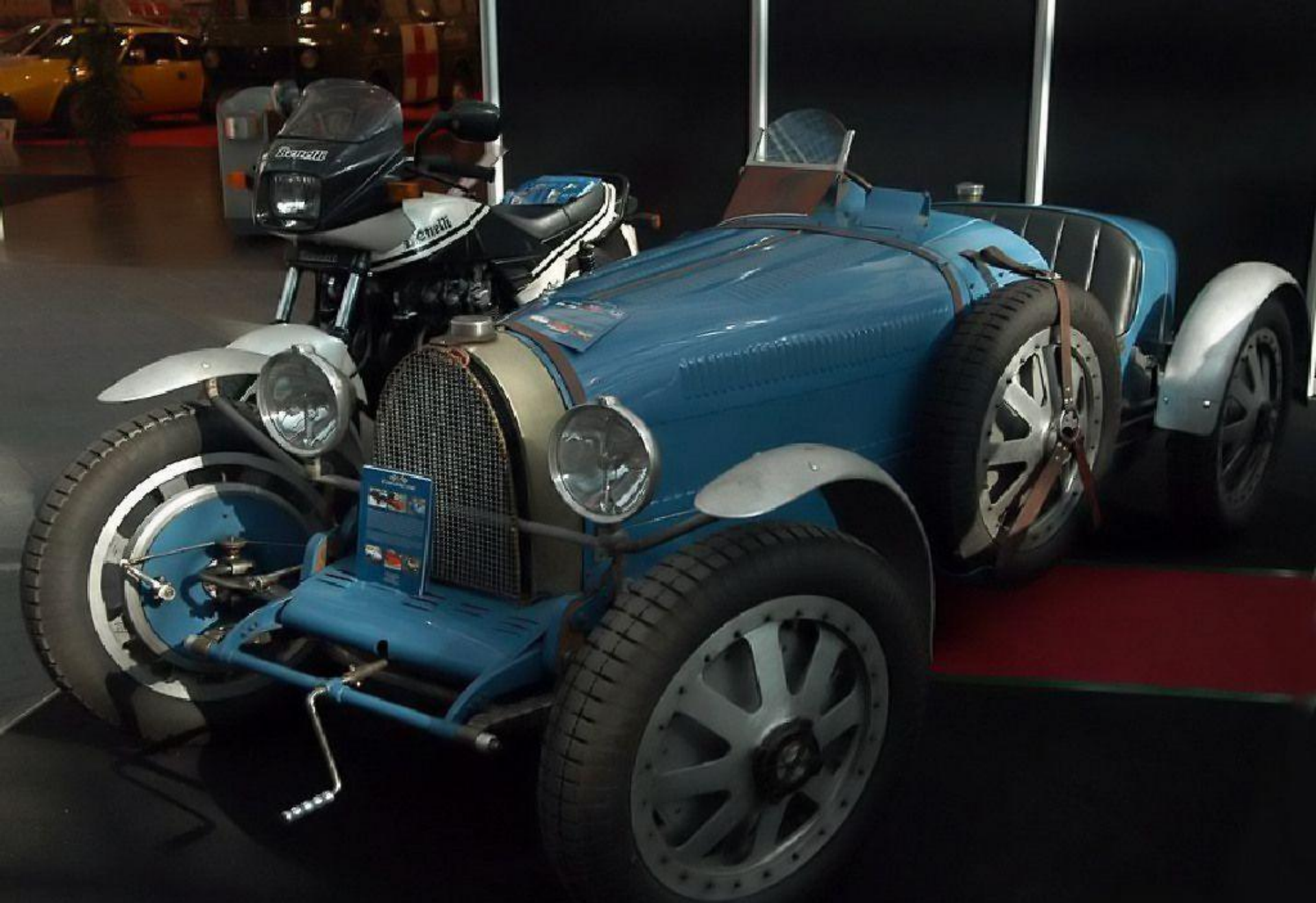
1928 Bugatti Type 35C 4865