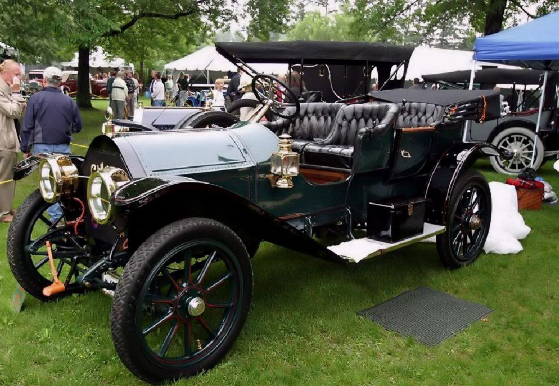
1911 Cadillac Model 30 Demi-Tonneau