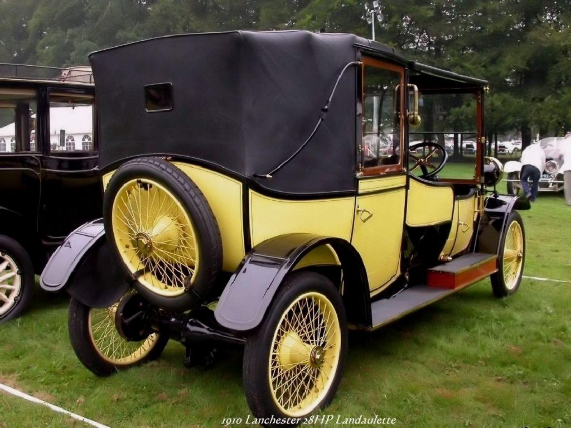
1910 Lanchester 28HP Landauette