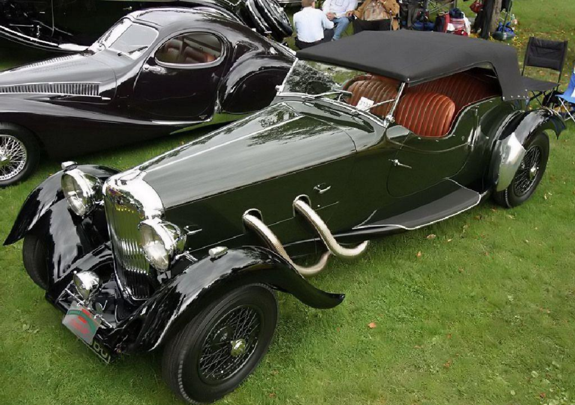
1937 Lagonda LC45 Rapide Tourer 12172R