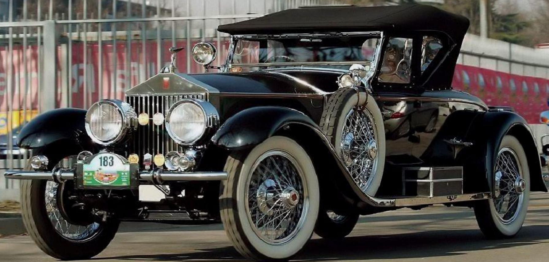
1923 Rolls-Royce Silver Ghost Piccadilly Roadster