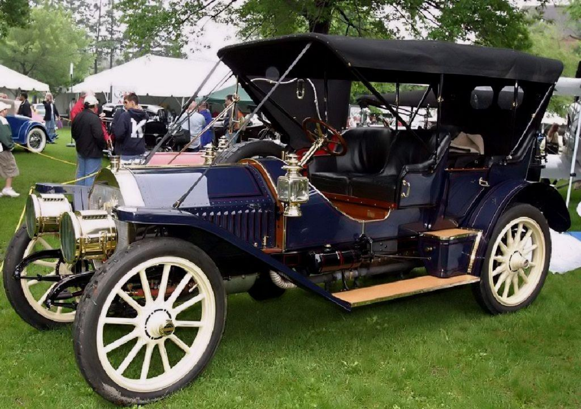
1914 Locomobile Berline Town Car