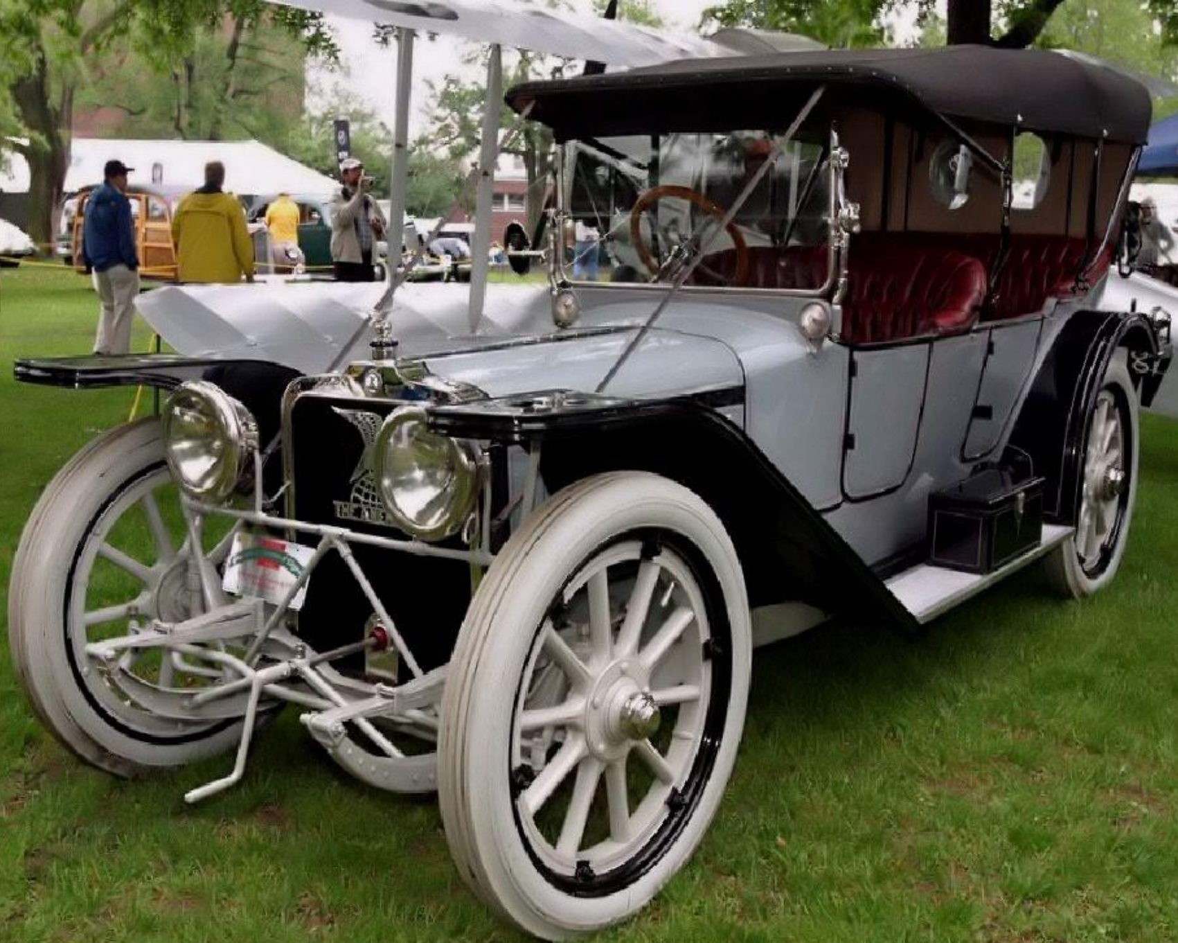
1914 American Underslung 6-60 Tourer