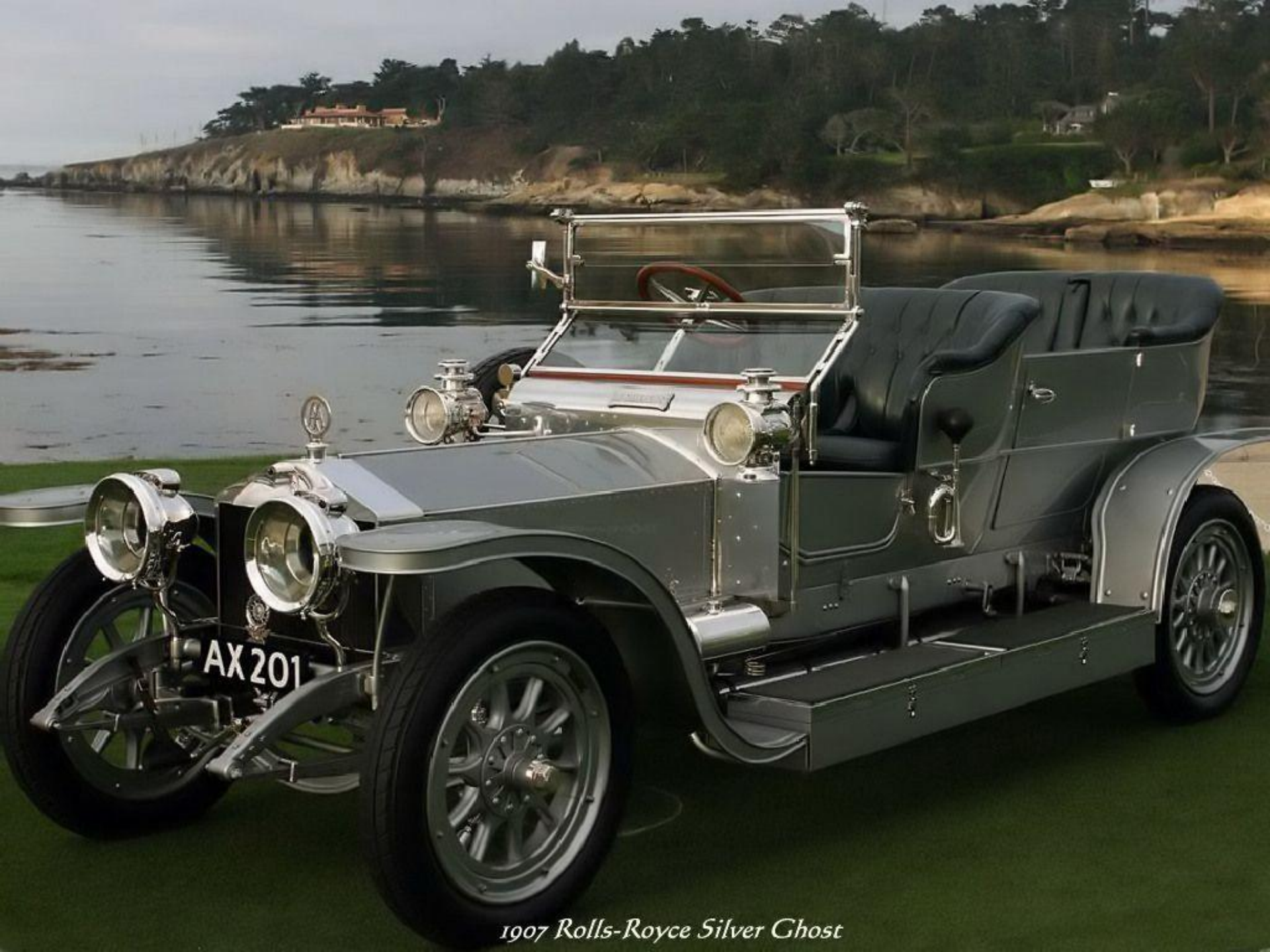
1907 Rolls-Royce Silver Ghost