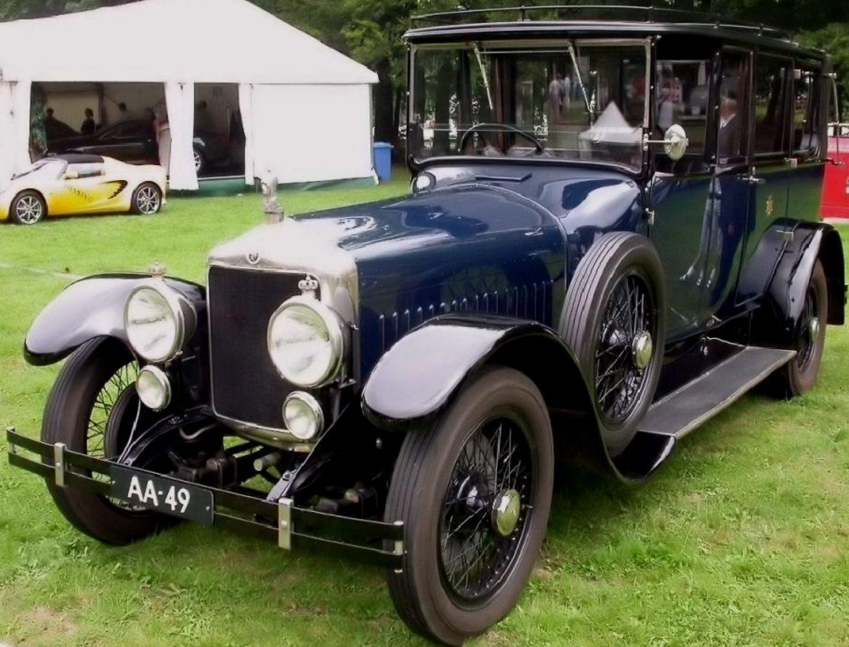
1925 Minerva Limousine Landaulette