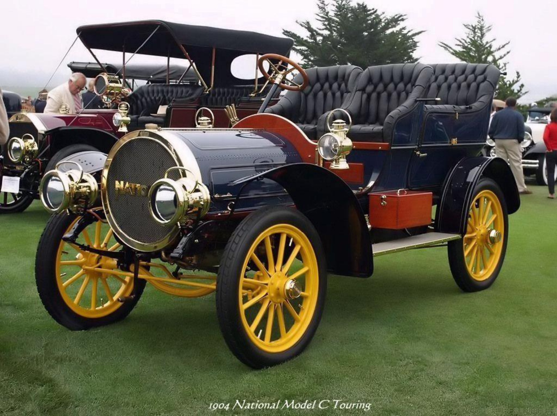
1904 National Model C Touring