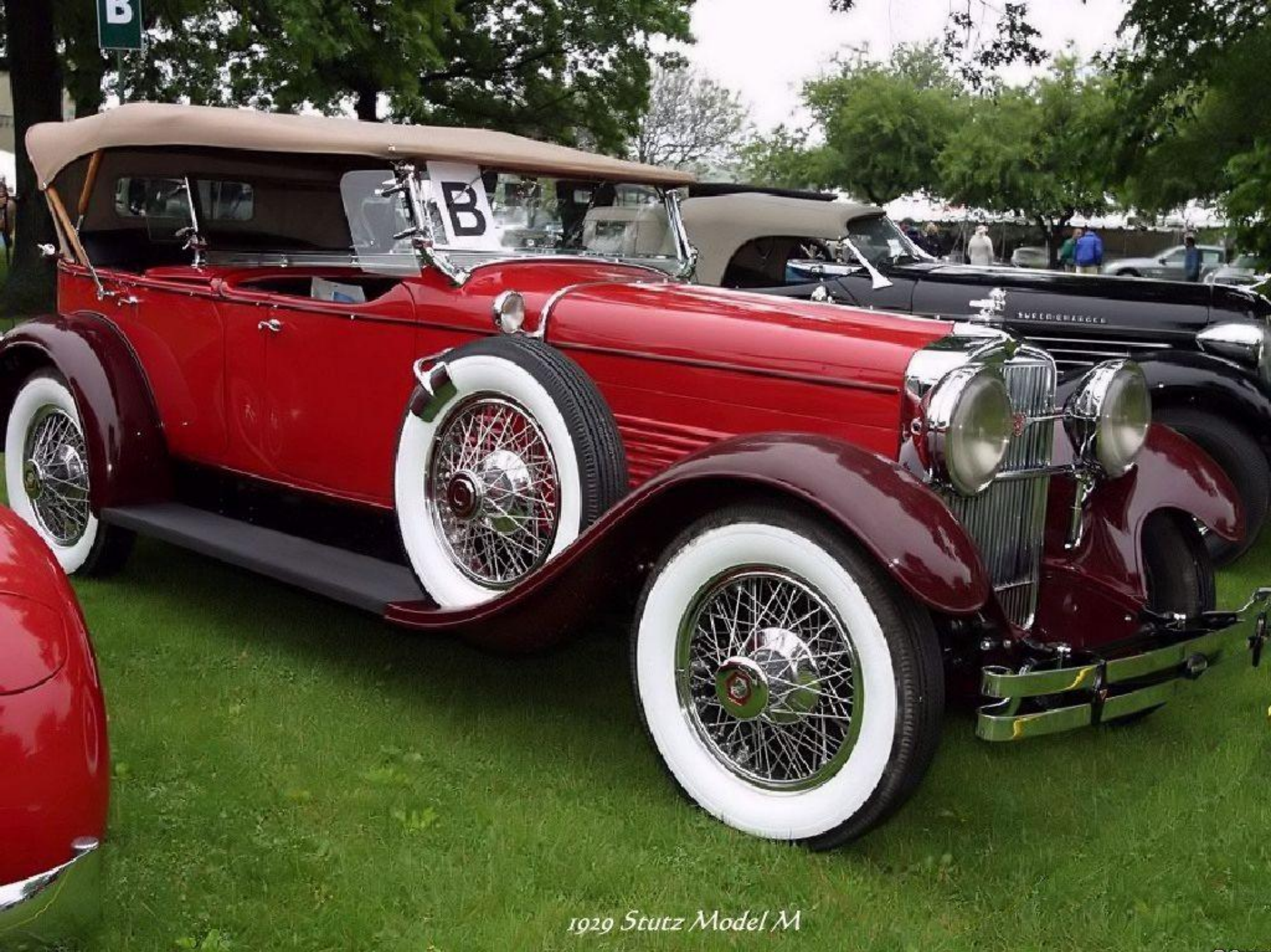
1929 Stutz Model M