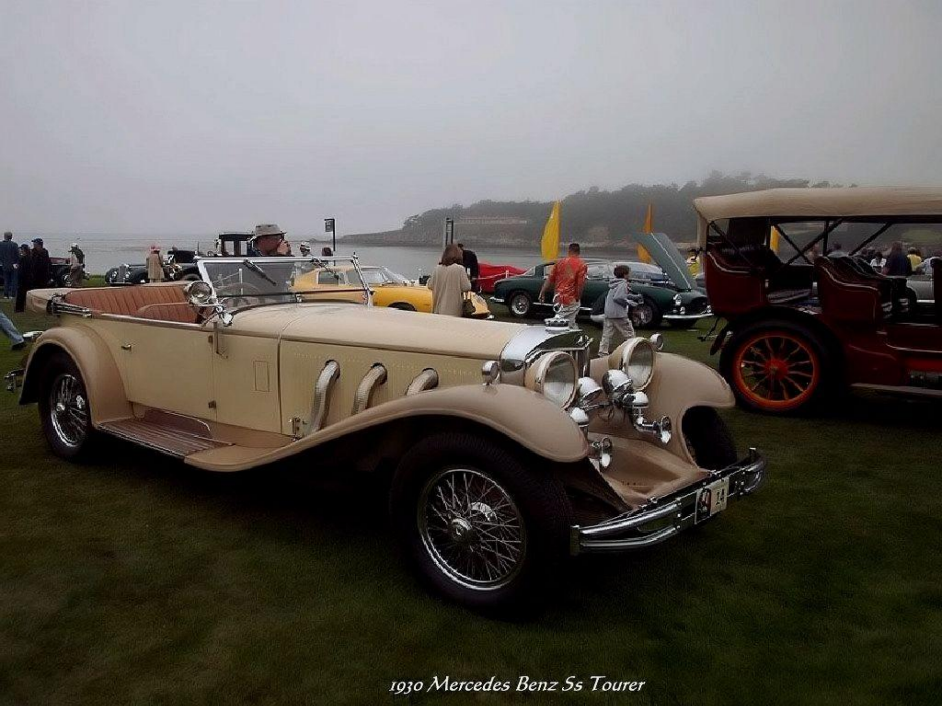
1930 Mercedes Benz S5 Tourer