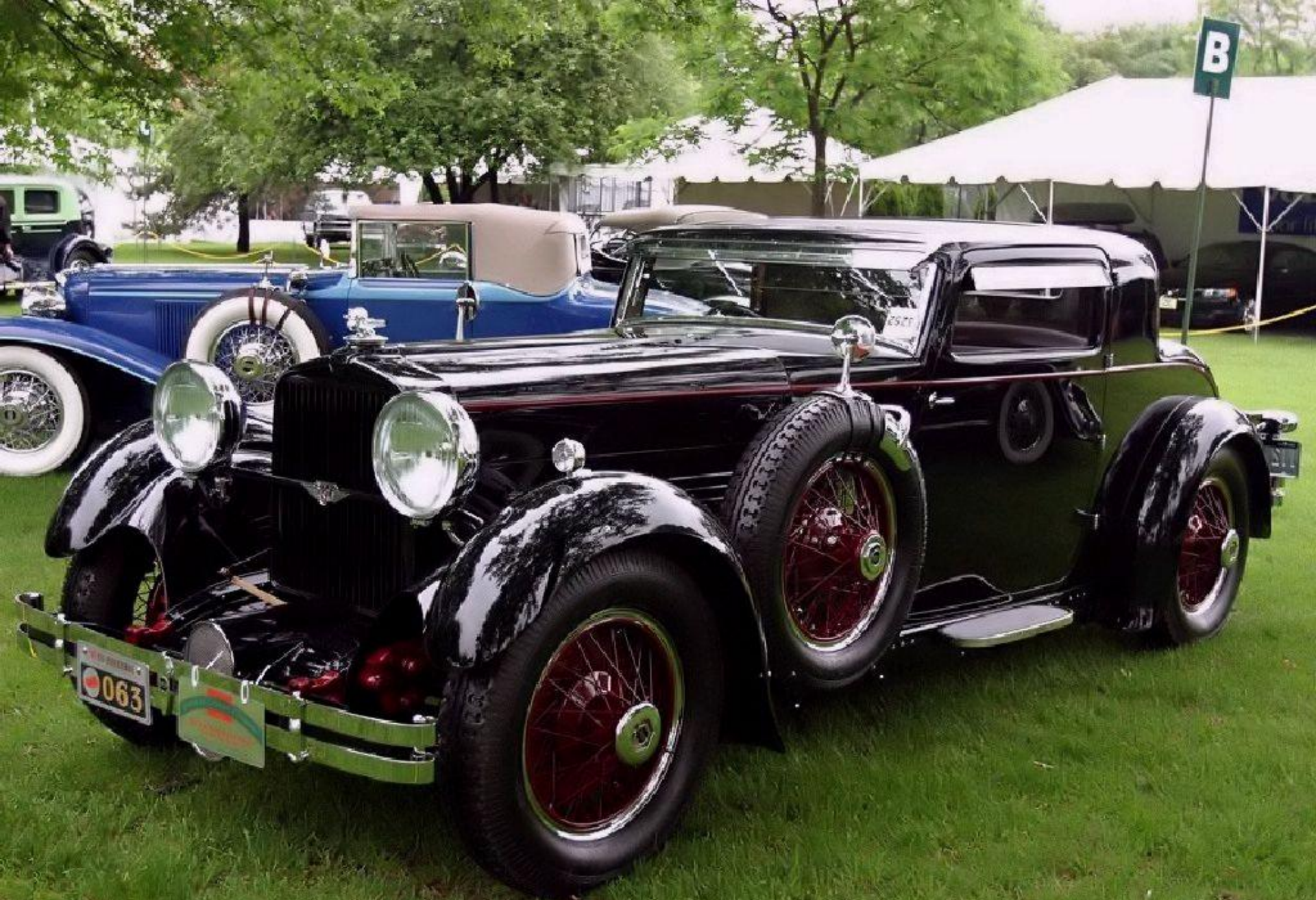
1929 Stutz Model M Supercharged Lancefield Coupe