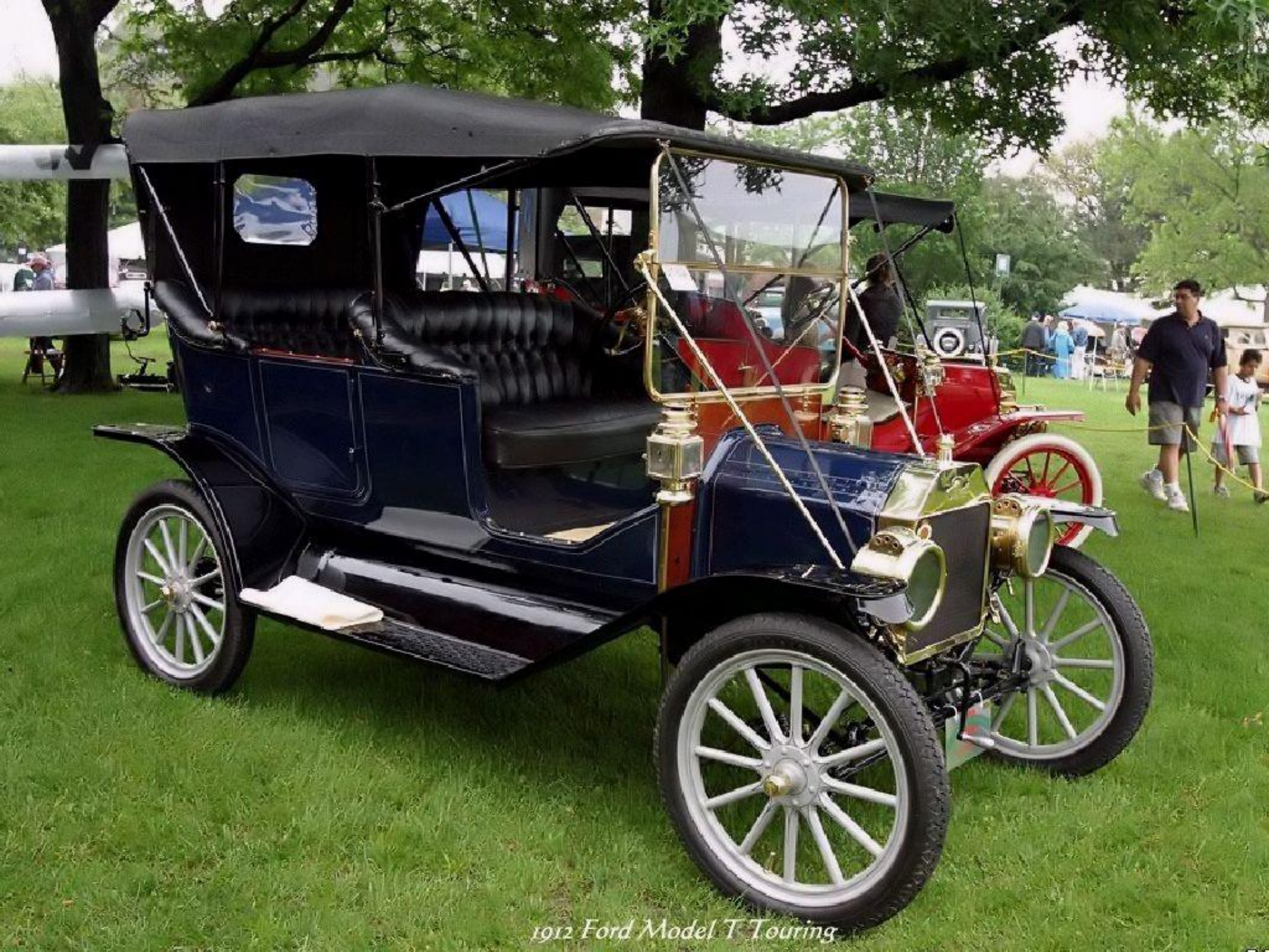
1912 Ford Model T Touring