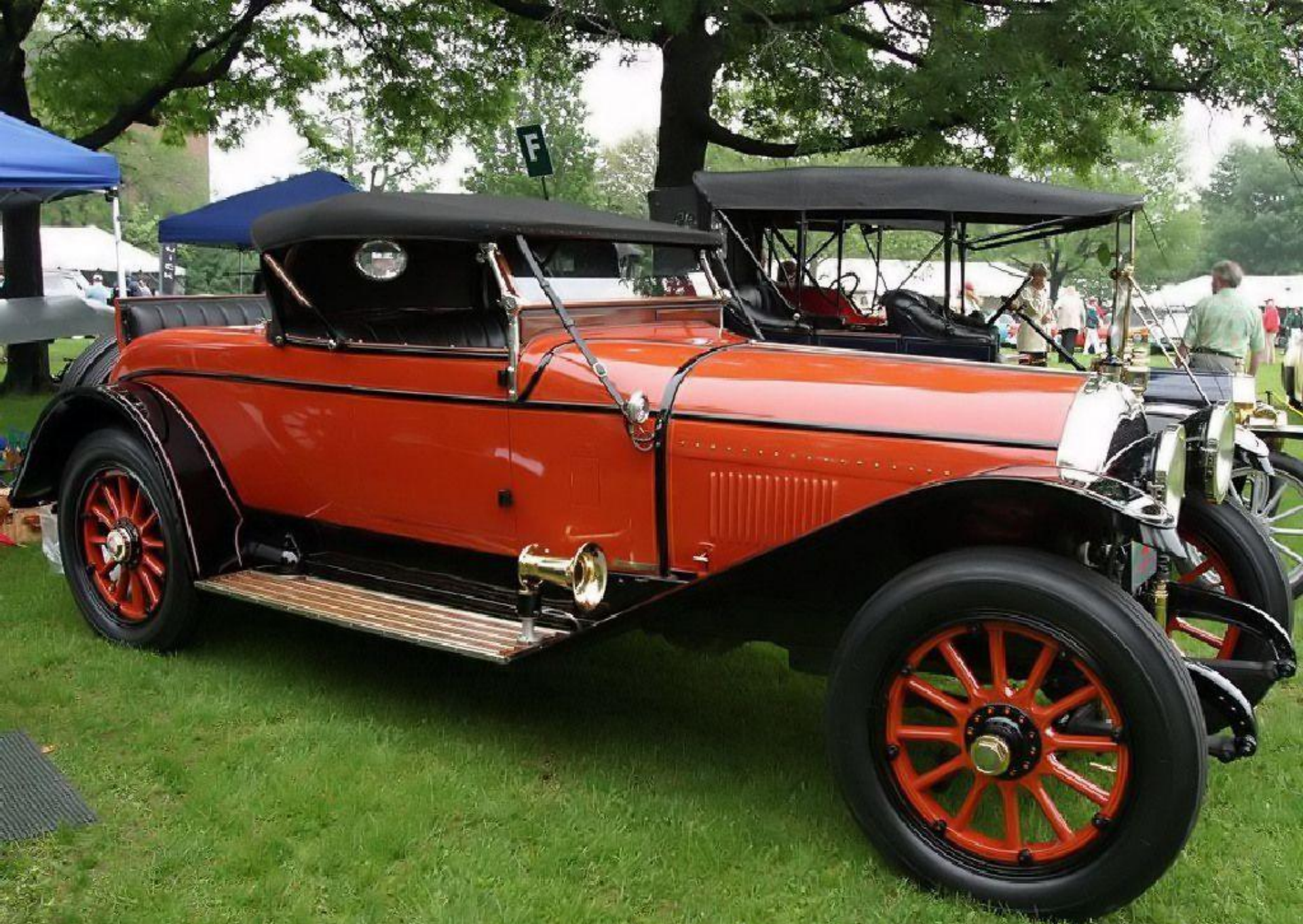
1915 Simplex Crane Model 5 Roadster