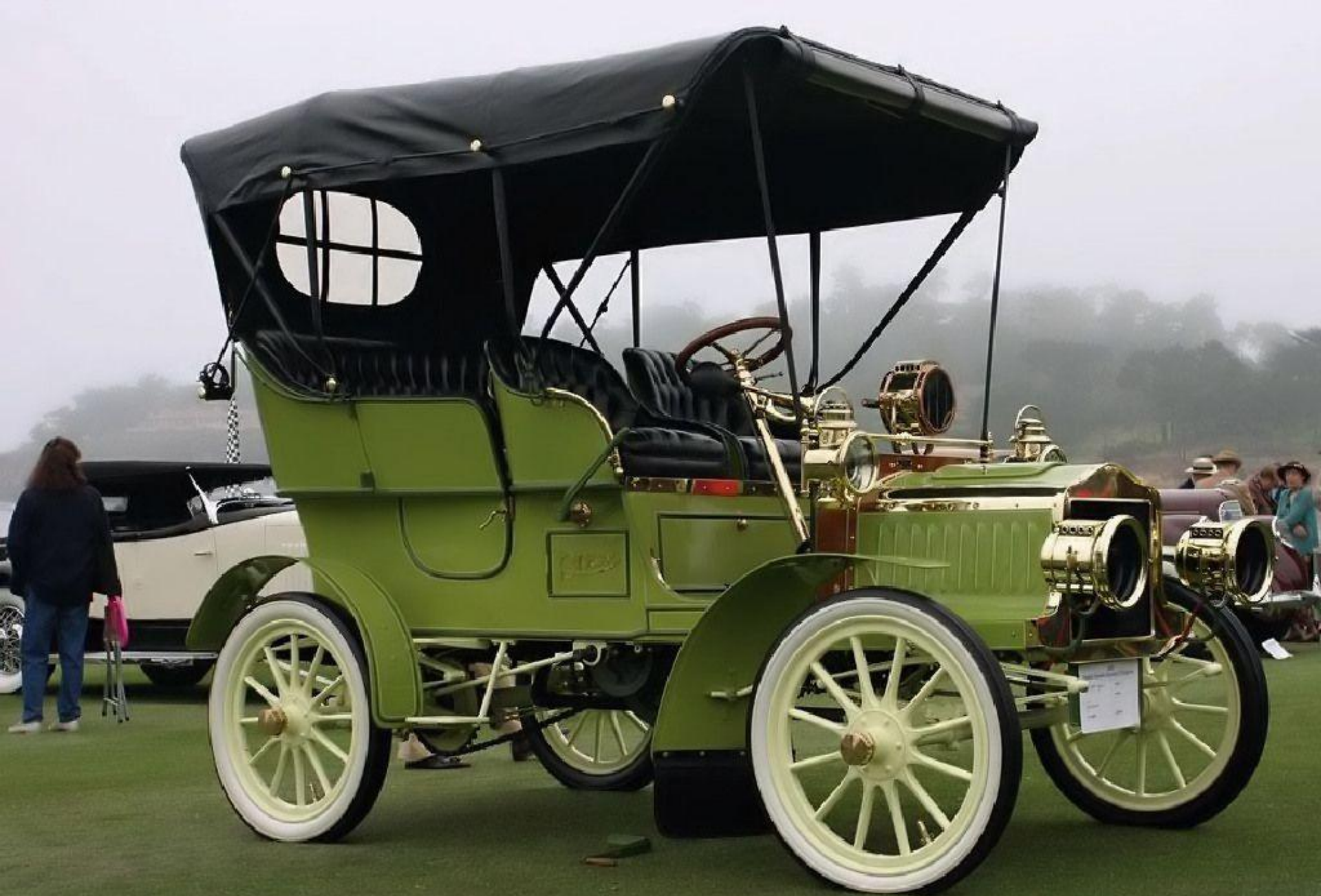
1905 Queen Model E Touring